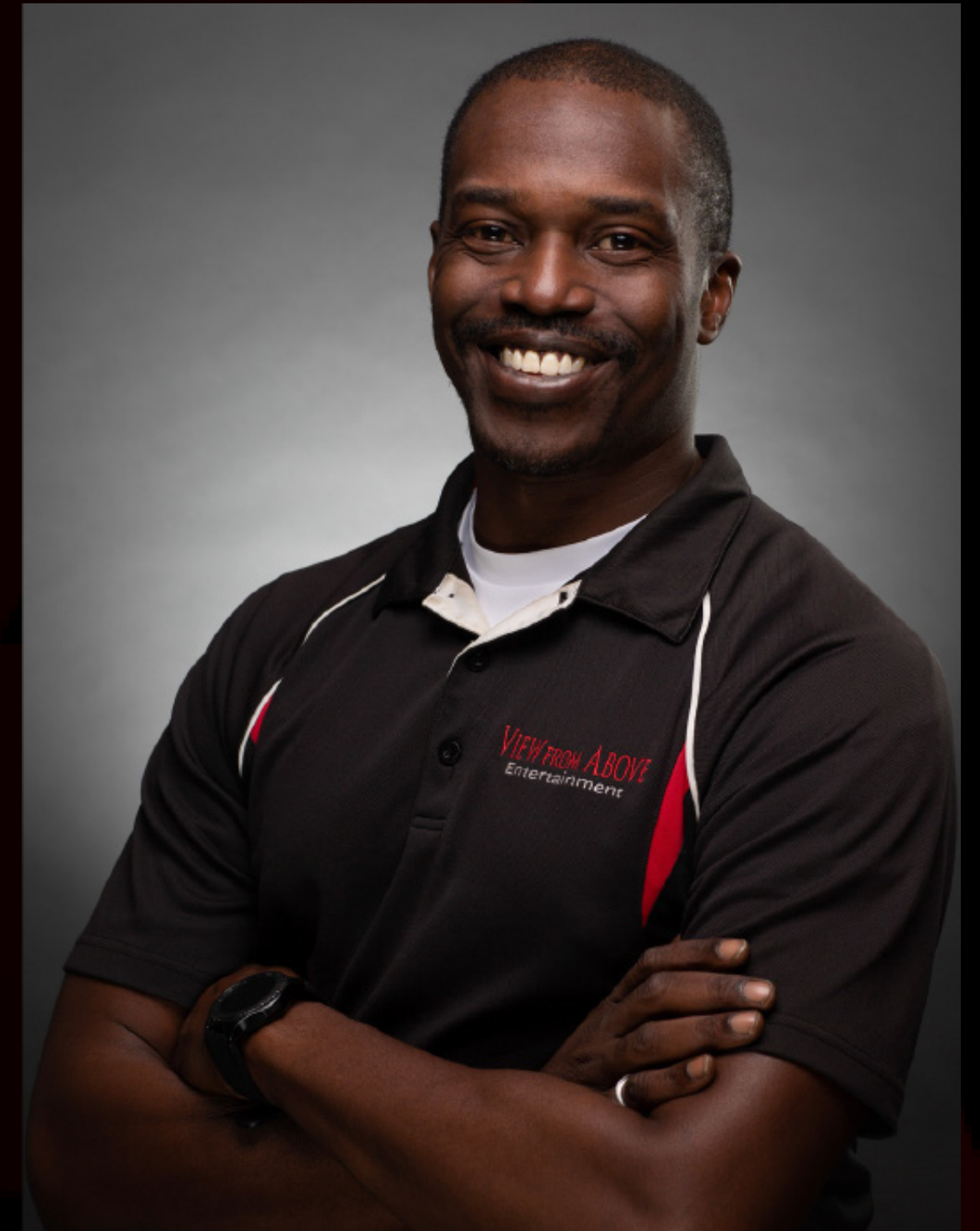
ITA UDO-EMA Founder